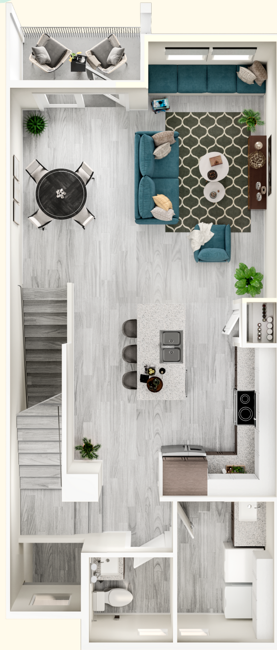
2nd floor layout