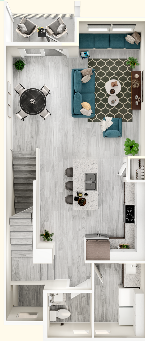
2nd floor layout