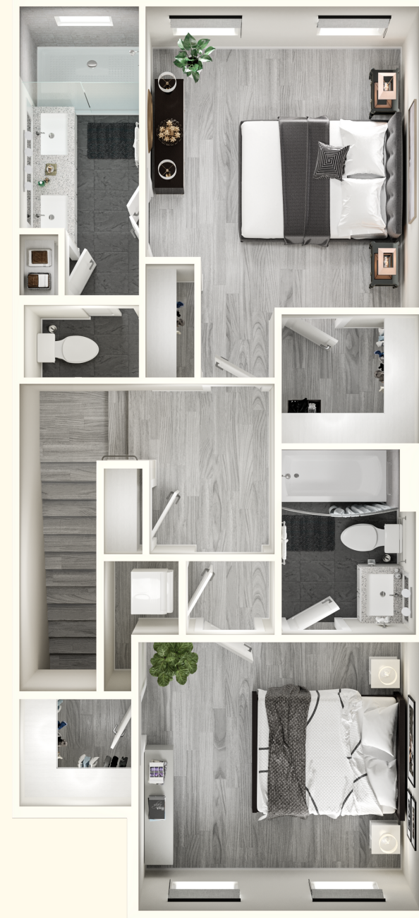
3rd floor layout