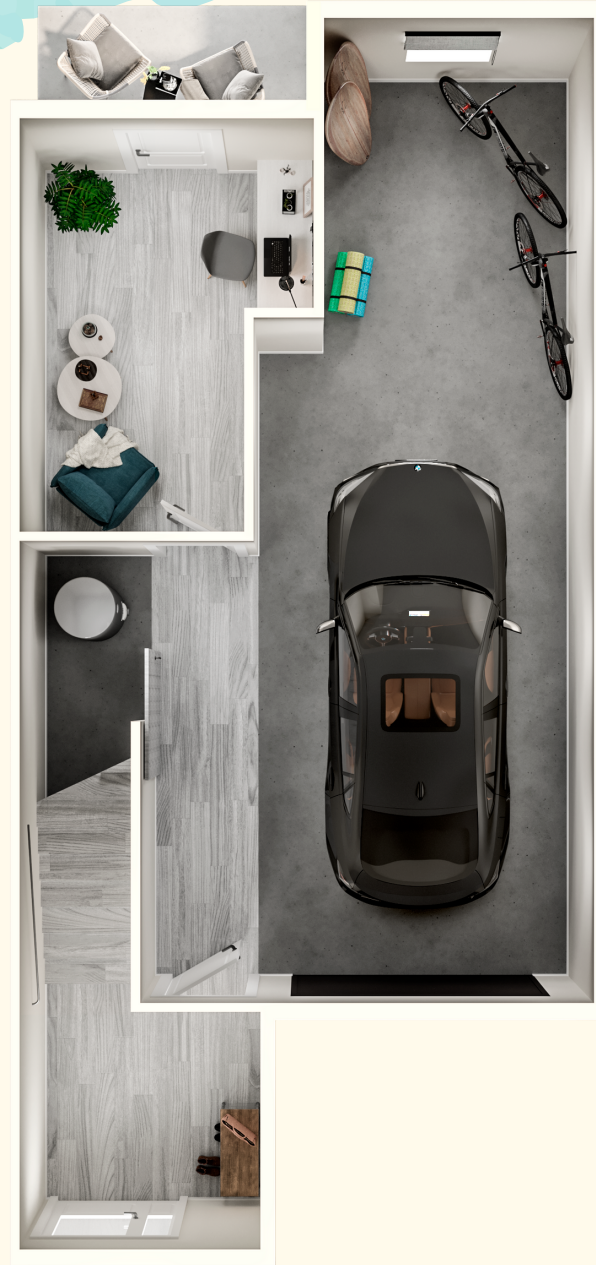
1st floor layout